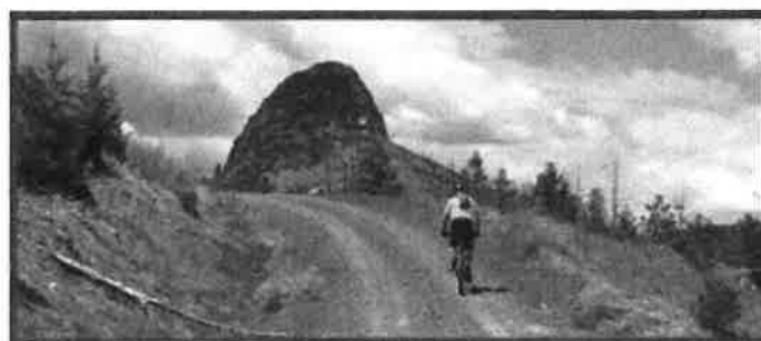
A cyclist takes on the trails of Plumas County, where a stronger recreation economy rides on the horizon.