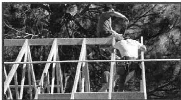
There are currently 655 jobs in construction in Plumas County, this accounts for 8.7% of total jobs.

The professional services realm shows increases across the board as well and is also set to expand, illustrating a broadening economic base as the county embraces technological advancements and diversified services.