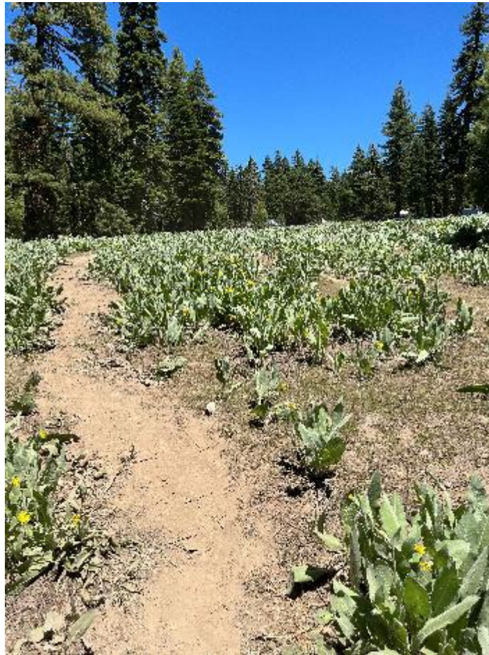
Main Trail at Site 1