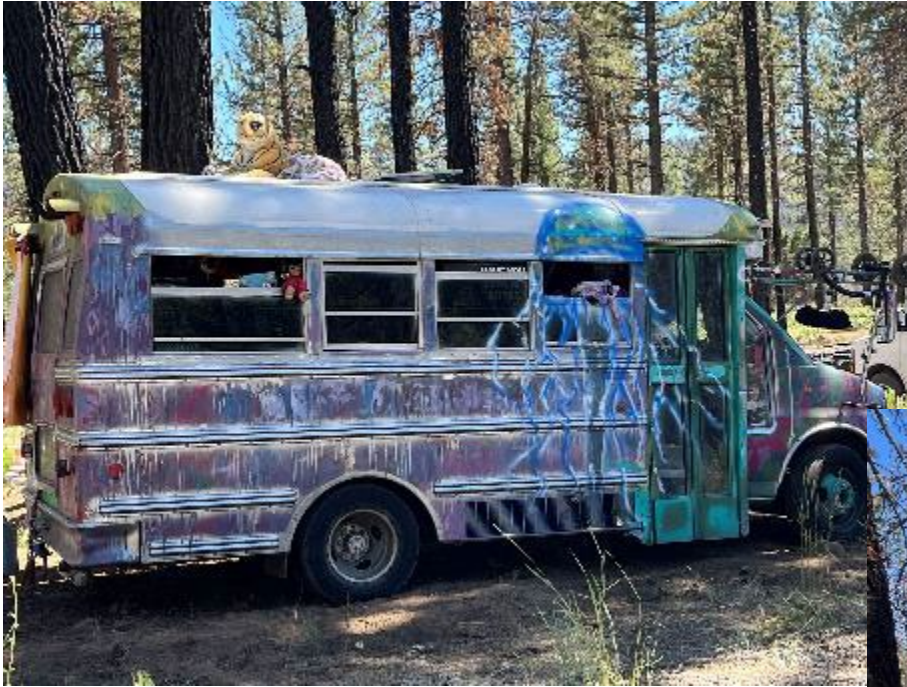
Bus at Site 2