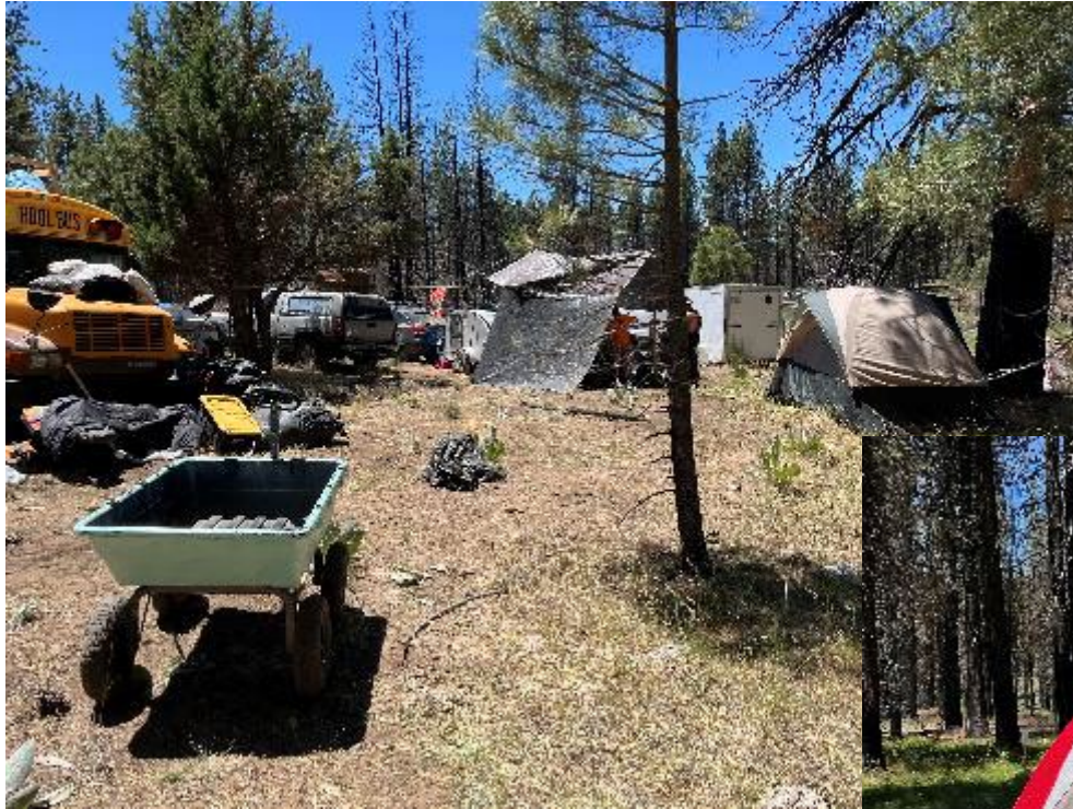
Camps at Site 2