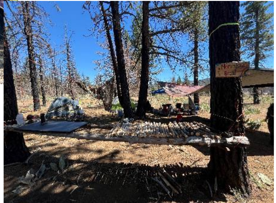
Kitchen at Site 2