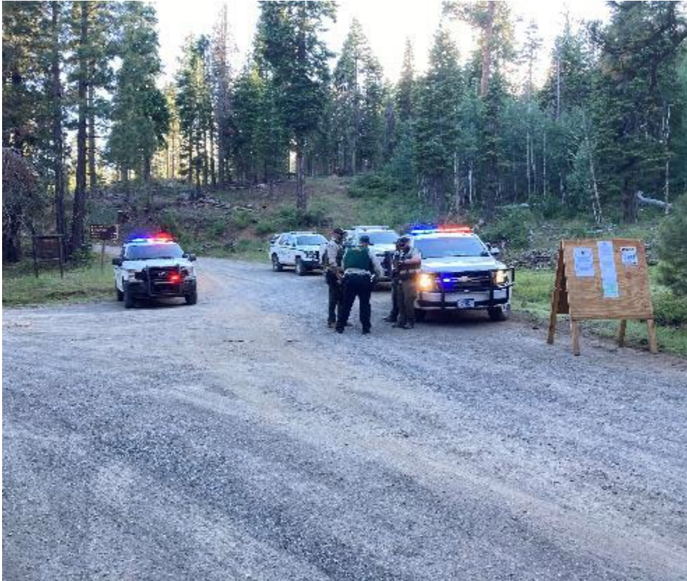
Site 1 Checkpoint